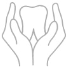
In safe hands

D o you know a friend or relative who has lost their natural teeth and is afraid of the prospect of wearing dentures? Are they looking for a lasting solution using dental implants?